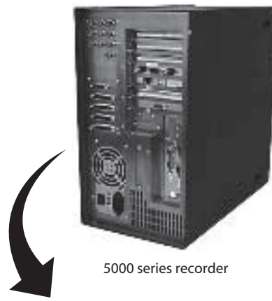
5000 series recorder

NAVCO's Digital Video Storage and Retrieval Systems track local bank teller/ATM transaction, local video surveillance, and alarm events while providing remote site retrieval for immediate resolution of customer disputes and Regulation "E" claims. Each type of images are stored separately, and can be programmed with separate retention periods. Information can be retrieved via dialup or over the bank's network. The NAVCO 5000 series greatly reduces the time and expense required to resolve customer disputes and eliminates the need to retrieve videotapes from remote sites. The 5000 series gives you more time to check on asset shrinkage, transaction fraud, and alarm surveillance, which lowers your losses and protects your profits.